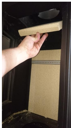
Lift the second throat baffle away from the retaining lugs and lower out