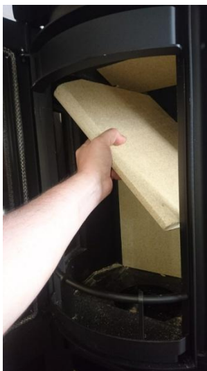
Now lower the throat plate baffle to remove

Attention, when removing the second side fire brick, ensure you support the throat baffle to prevent it from being dropped