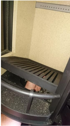
Pull out ash drawer, and remove grate