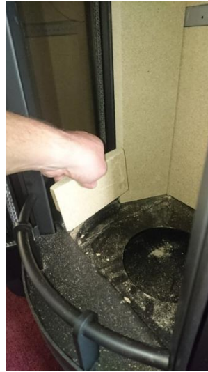
Remove both smaller side bricks