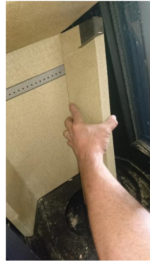
Carefully lift out both side fire bricks, ensuring the securing clip remains with the brick.

Attention, when removing the second side fire brick, ensure you support the throat baffle to prevent it from being dropped